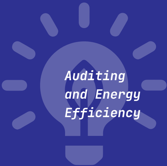
Image4All is an Engineering company dedicated to the diagnosis, development and integrated implementation of:

We are an Engineering company dedicated to the diagnosis, development and integrated implementation of Energy solutions.